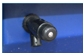
| Push/Stop pour tap