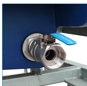
| 2.5" Valve