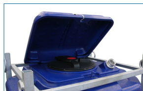
| Lockable manway cover