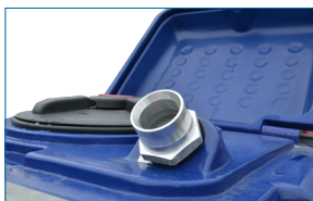
| Instantaneous filling port